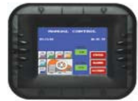
LTP - S6C-F