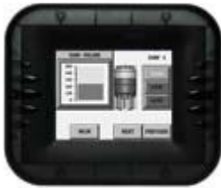
LTP - S6M-F