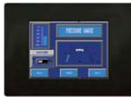
LTP - S6W-RS