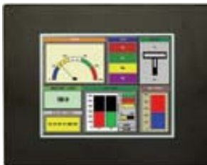
LTP - S8C-F